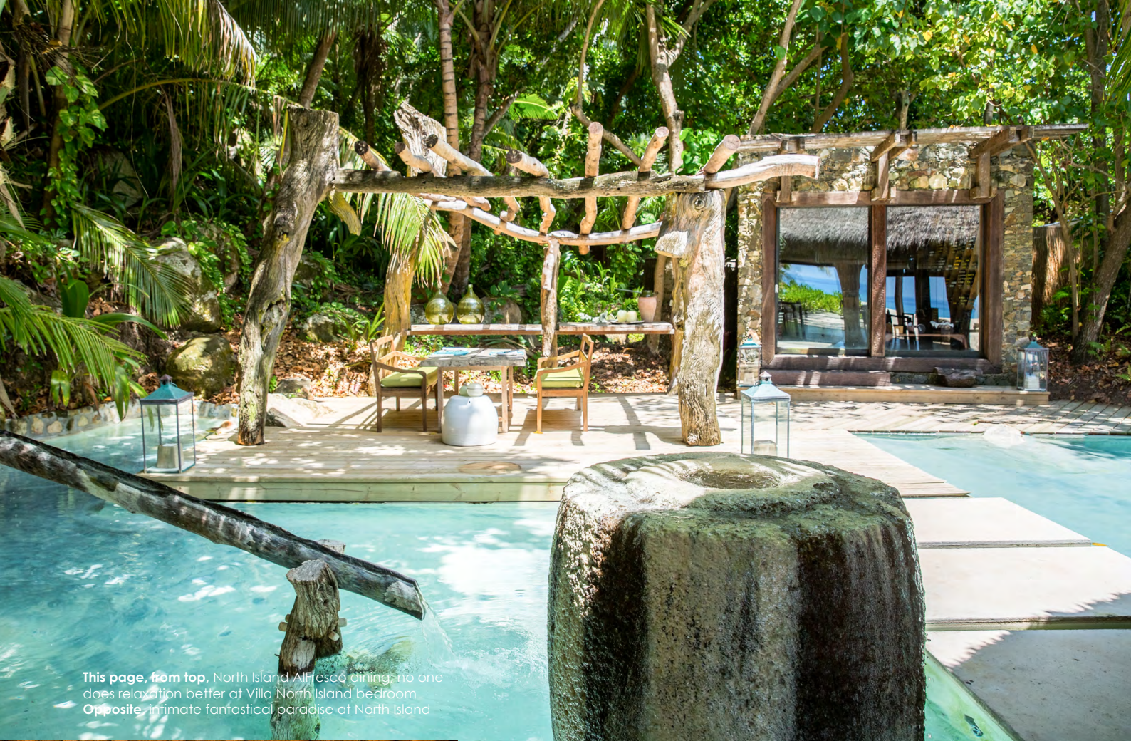
This page, from top, North Island Alfresco dining; no one does relaxation better at Villa North Island bedroom. Opposite, intimate fantastical paradise at North Island