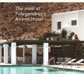
The pool at Folegandros's Anemi Hotel