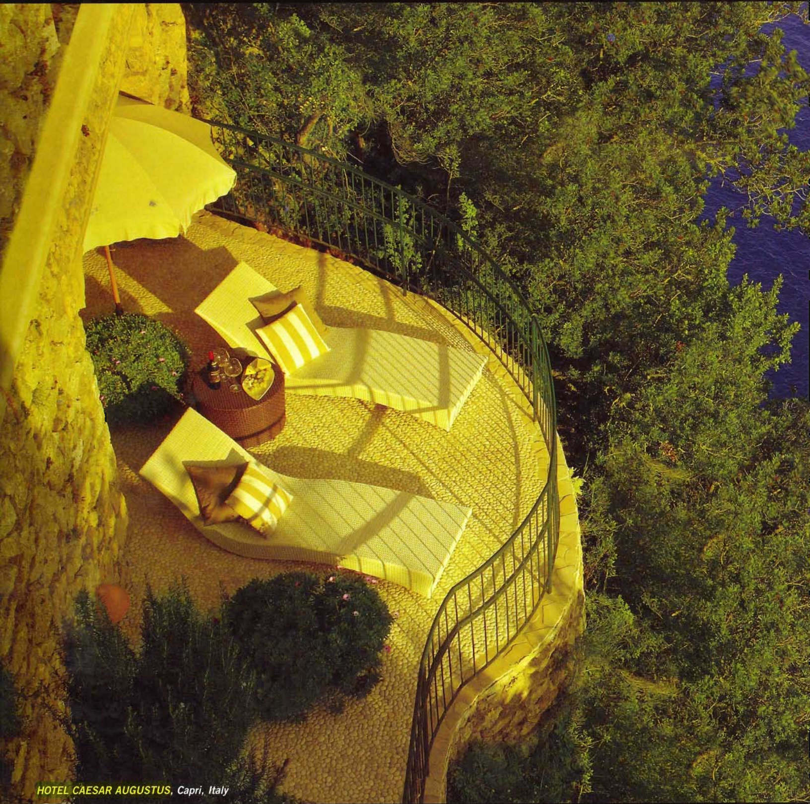
HOTEL CAESAR AUGUSTUS, Capri, Italy