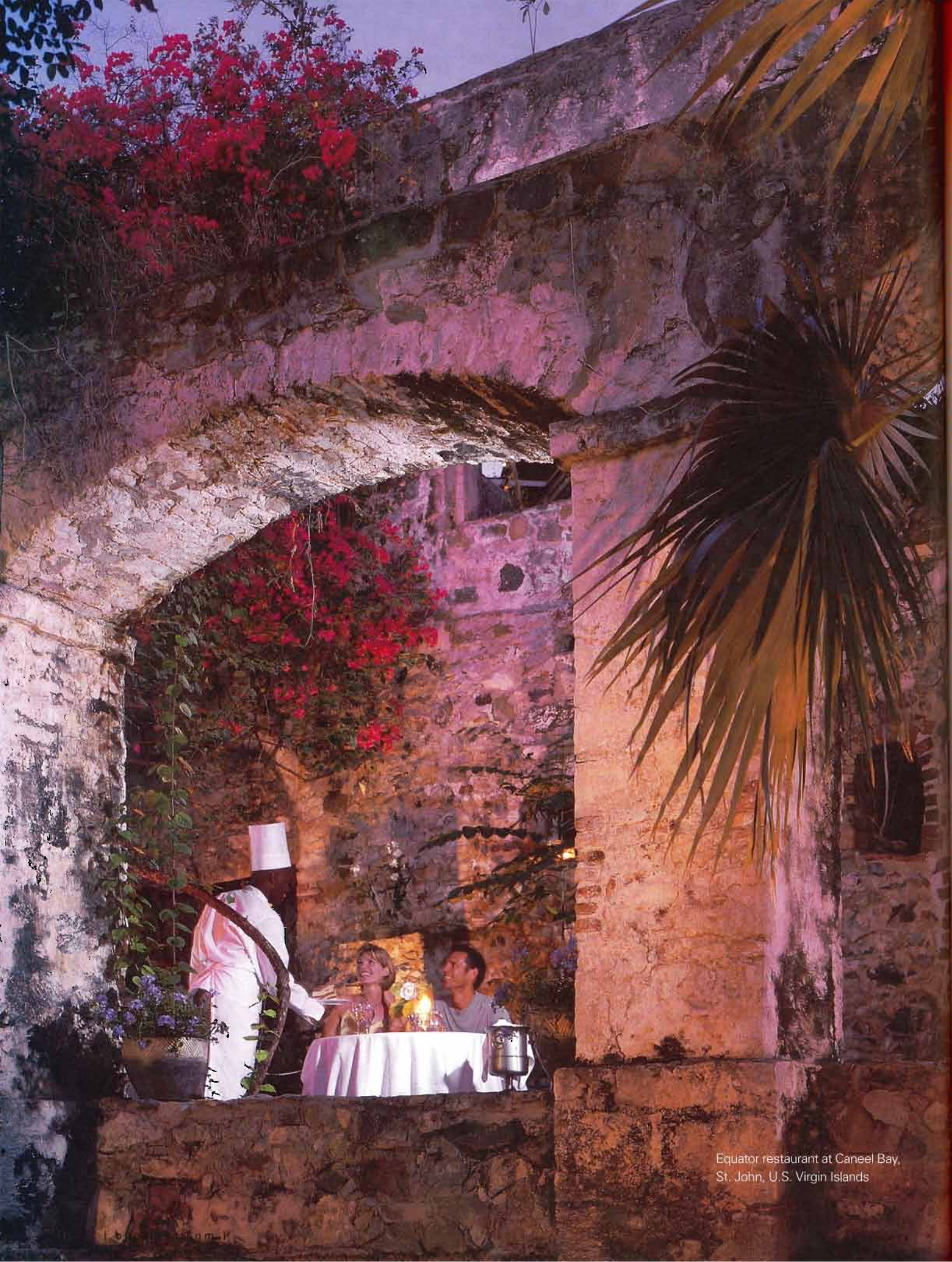
Equator restaurant at Caneel Bay, St. John, U.S. Virgin Islands