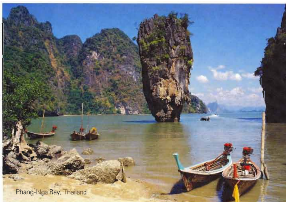
Phang-Nga Bay, Thailand

Where to stay: The Sarojin, which nests on 10 acres between a lagoon and the Andaman Sea in Khao Lak, is less than an hour from Phuket Airport, the Similan and Surin islands, Phang-Nga Bay and three golf courses. Each of its 56 accommodations has a king-sized bed and a bathtub for two; many also feature a private plunge/relaxation pool. The resort employs "imagineers" to fulfill your requests—from a private cruise on the Sarojin's luxury boat to an elephant trek to a Champagne jungle safari. Couples can indulge in the two-hour Adventure Revival massage at the spa, sunbathe anywhere along the seven miles of beach or recline within a curtained pavilion that appears to float above the infinity edge pool. Rooms start at $429 per night. (sarojin.com)